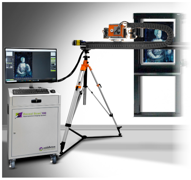
Figure 3. RevealScan 100 Hyperspectral Imaging System for art art cultural heritage from Middleton Spectral Vision.

Examination of the extant work using the novel technique of SWIR Hyperspectral Imaging provided the answer. The painting was brought to the application laboratory of Middleton Spectral Vision in Middleton, WI. A RevealScan-100 (Figure 3), equipped with an extended range SWIR (1000-2500 nm) hyperspectral camera from Specim Spectral Imaging Ltd was used to scan the painting. The hyperspectral scans were stitched using kemoQuant™ (Middleton Spectral Vision, Middleton WI) chemometric imaging software to show the possible information below the visible paint layer.