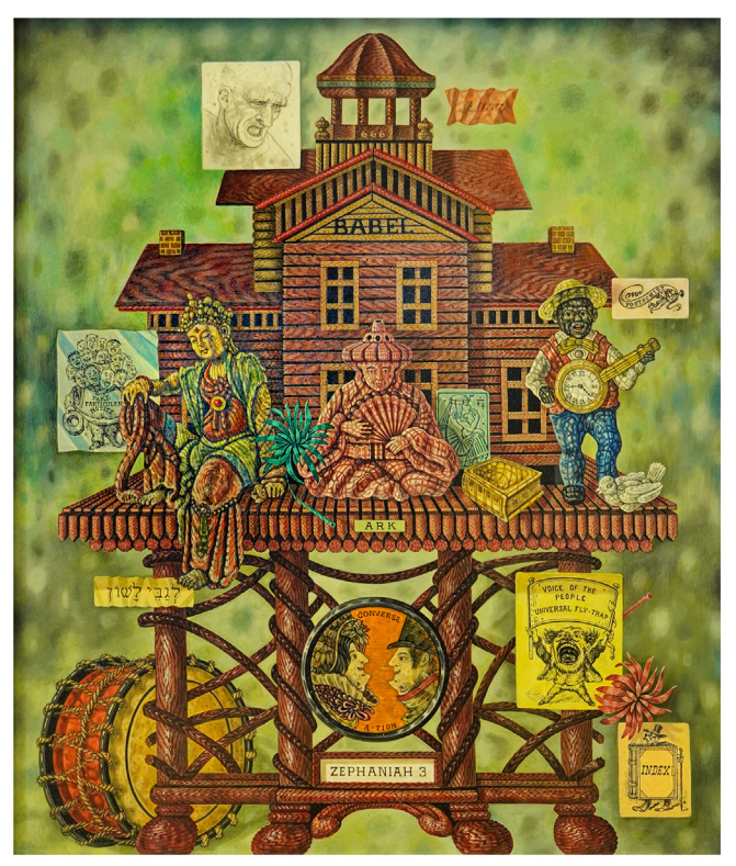
Figure 1. Larry Elliott: The Babbling Tower. Oil on panel, 24 x 20 in. Signed, upper right (catalog #E-60/3461). Estate of the late Larry Elliott

Researching the history of this work, it transpired that in a booklet New Paintings (Figure 2) by Larry